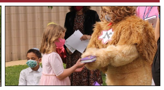
Our students received their own personal Siddurs during our annual Siddur Ceremony!