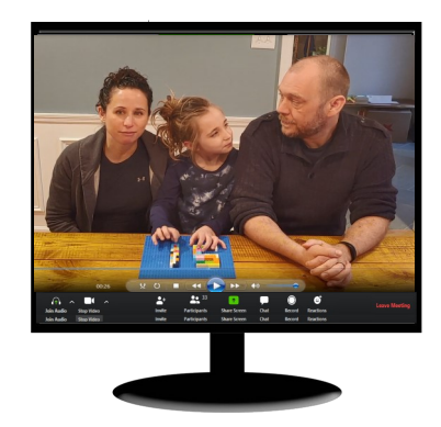
The Rairdan Family, one of many families who shared a video entry to help spread our message and raise money!

We had hoped to raise $51,000 in 51 hours by doubling every donation, and thanks to our very