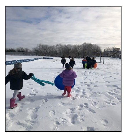
It snowed and our students wasted no time enjoying the chance to be outdoors, no matter the weather.