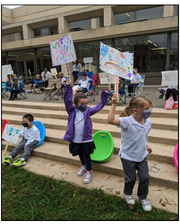
Students took part in their own election to elect a school mascot — the Eagle won!