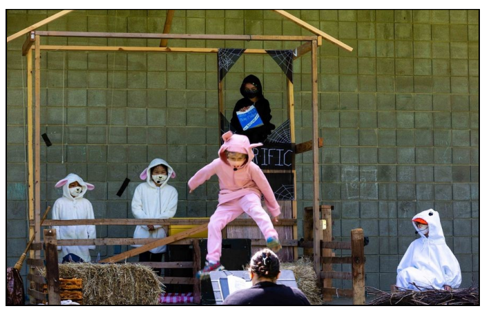
We continued our annual Spring Play tradition with an outdoor production of Charlotte's Web, which was a terrific success!